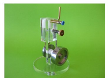
Finished tech project - a steam engine from plastic.

about a student at a college who had fantastic welding talents, but hardly allowed to touch so much as a hammer. This came as no surprise to me